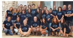
How to apply to the call

Applications for enrolment to the CMBE Master Course must be completed online according to the procedure described on the UNISALENTO INTERNATIONAL website ( https://international.unisalento.it/ , https://international.unisalento.it/departments/disteba )